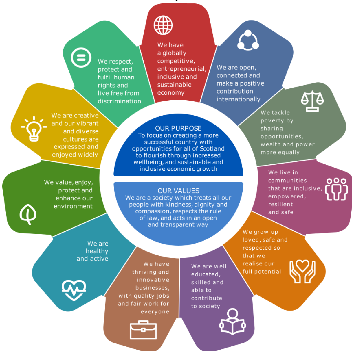
Figure 1-3 Scotland’s National Performance Framework

The actions within the NTS2 Delivery Plans will also contribute to achieving the Scottish Government’s National Outcomes contained within the National Performance Framework as shown in Figure 1-3.